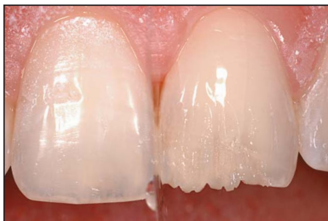
Figure 6. A composite with dentin opacity was used to form the majority of the lingual aspect and was intentionally left undercontoured prior to polymerization.