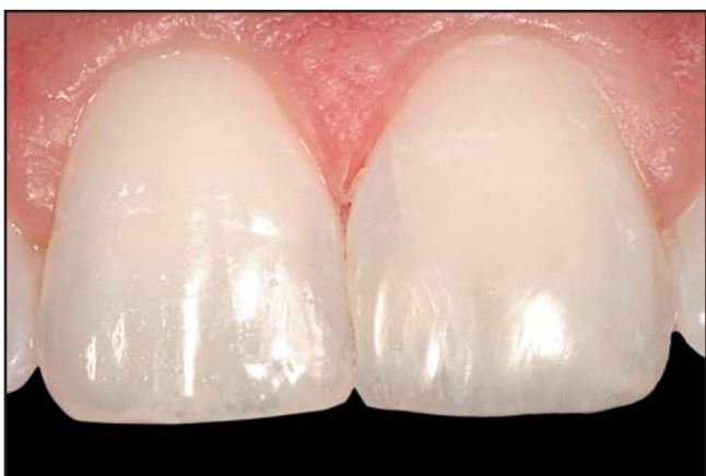
Figure 9. Because the restoration was still slightly undercontoured, sufficient space remained for the final enamel layer, which concealed applied to conceal the substructures and was overcontoured for finishing.