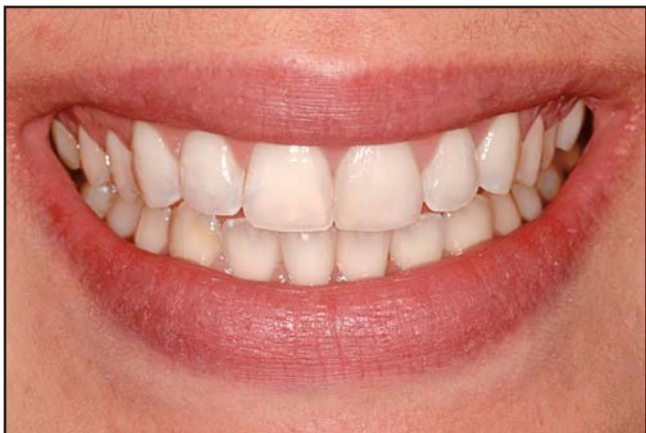
Figure 13. Postoperative smile appearance demonstrates harmonious integration and pleasing aesthetics.

and one that was excellent. (Figure 13). Tissue and color may also be removed from a postoperative image for a more thorough analysis.