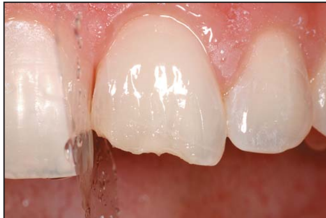
Figure 5. Following removal of the trial materials, an irregular, long bevel was used to facilitate acid etching and placement of a bonding agent.

A low-opacity incisal layer, with 1 mm to 2 mm of overextension, was placed to restore the incisal edge (Figure 7). In order to build the innate characterizations of the tooth, the material was placed in an irregular manner,