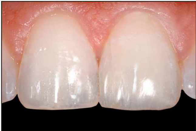
Figure 11. The restoration was then enhanced by adding composite, contouring, and finishing.