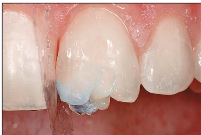
Figure 4. Various composites were tested to determine which material would deliver the desired opacity

intraoral (eg, soft tissue color, shadows, unnatural tooth lighting). Lighting, fatigue, influence of other tissues, and bias towards certain shades are all factors that must be overcome when focusing on the patient's needs. Well-composed images that may be reviewed on a large monitor away from treatment room distractions can ensure that an accurate plan is formulated.