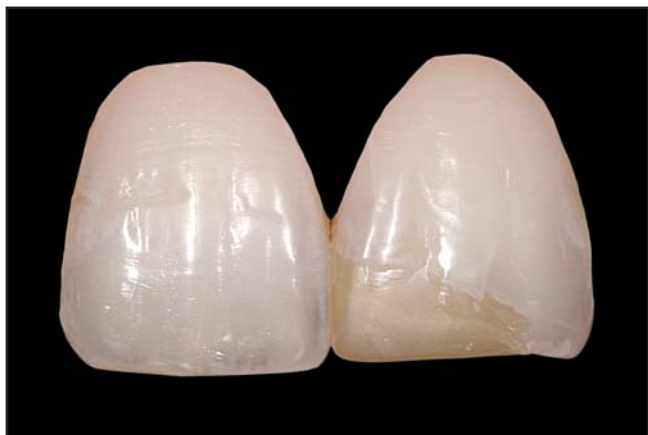
Figure 3. Removing soft-tissues from the image with photographic editing software may further enhance observation.