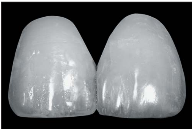
Figure 12. Grayscale imaging can be used to evaluate the restoration's value.