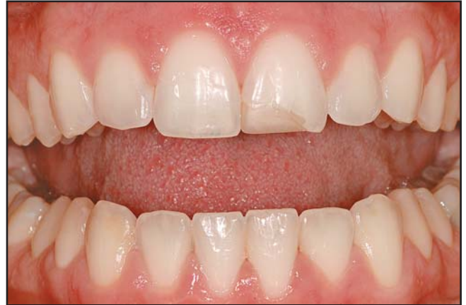
Figure 1. Preoperative view of a patient with a 14-year-old composite restoration that no longer satisfied her aesthetic demands.

Polychromatic layering of composite resin enables the clinician to effectively recreate the innate properties of the tooth structures, provided the material characteristics and proper layering techniques are understood. 9 By coupling common photographic techniques with an understanding of these varying opacities and tints, composite restorations with natural detail may be created. 9 The greatest obstacles lie in determining where to place the various composites and envisioning the final result prior to placement. In a Class IV case, there are often variances in tooth colors, opacities, and texture that make material choice and placement a challenge for the practitioner. 10 Digital photographs represent an efficient method for the clinician to plan, deliver, and enhance such restorations. 11 As highlighted in the following technique, consultation using preoperative photographic images can provide the clinician with the vision needed to complete these restorations.