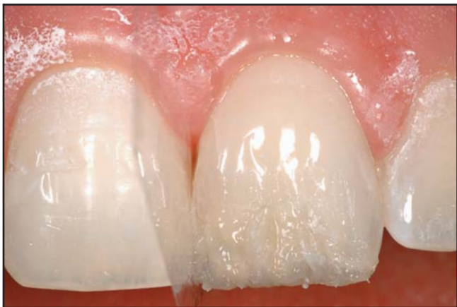
Figure 8. Various, custom, white opaque and honey-yellow tints were irregularly placed on the dentinoincisal composite framework.