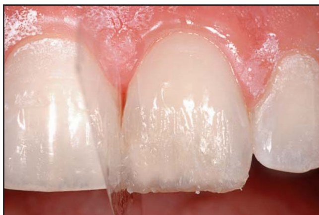
Figure 7. A low-opacity incisal composite was placed with a slight overextension to complete the length of the restoration and restore the incisal edge.