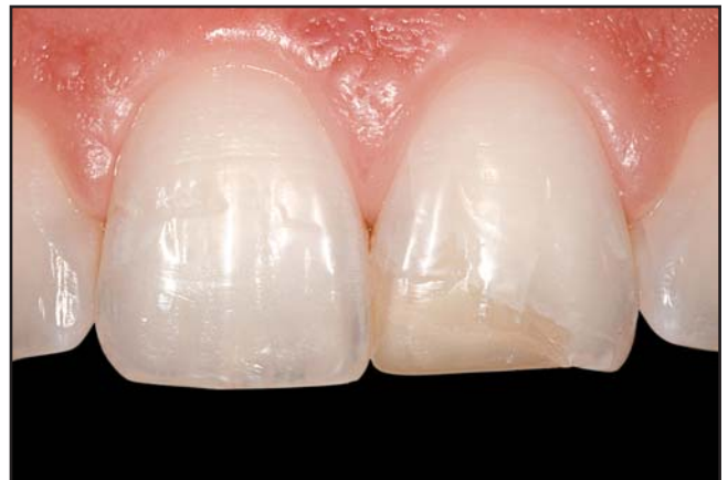
Figure 2. A high-resolution, magnified image can yield a greater sense of tooth character when examined away from operatory distractions.

With only a few images, and with less time than is normally required for the assistant to explain the procedure to the patient, digital images can be referenced and a restoration prescription quickly established. Following placement, similar images can be taken, non-distracted evaluation can be accomplished on a monitor, and a systematic outline for restoration enhancement can then be created. In the author's experience, these photographic steps enhance the restoration, precision, and speed.